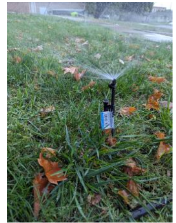
New irrigation sprinkler!