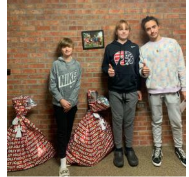
Presbyouth went shopping for Angel Tree gifts!