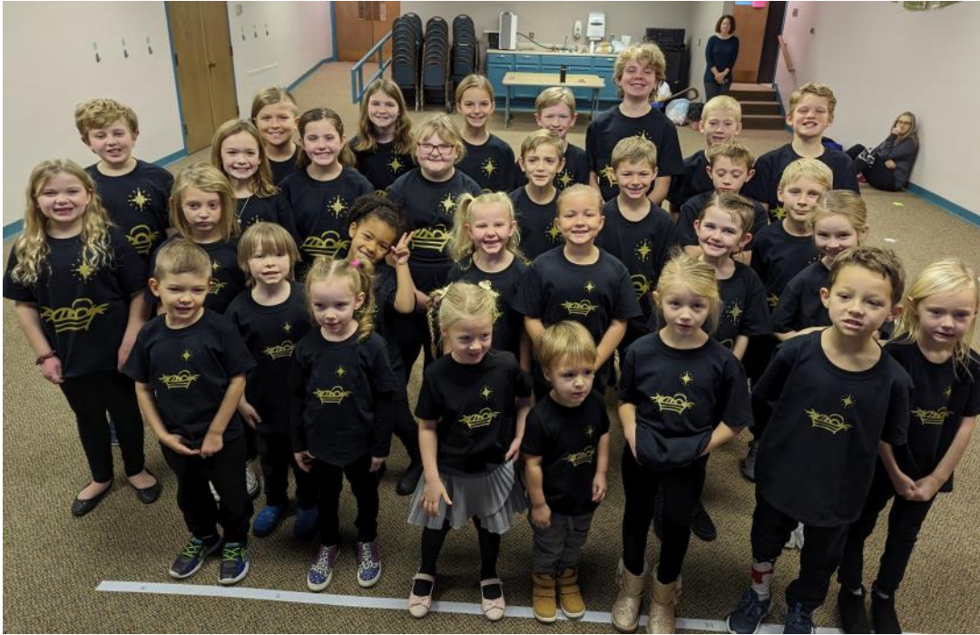
Our kids looking sharp in matching shirts for the Christmas Program on December 11!

Do you have a passion for helping? Do you want to do good in your community? Do you want to have a say in the service and missions of our church? Come to Service Learning Wednesdays for K-5th graders this winter. During this time you will explore what community means and ways that you can help your community. You, the students , will choose, research, plan and implement a service project. You will get to make decisions and follow your passions. You will spend the first four weeks researching and planning, the fifth week implementing and the last week debriefing and celebrating. This is an opportunity to use your talents to do some good and help others while making friends and learning!