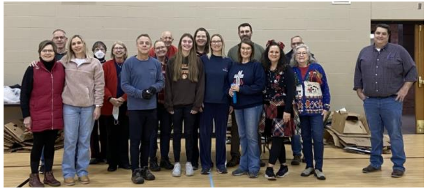
Deacons and more on delivery day!